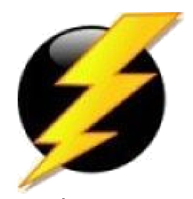
<u>Lake Forest</u> <u>Elementary</u>