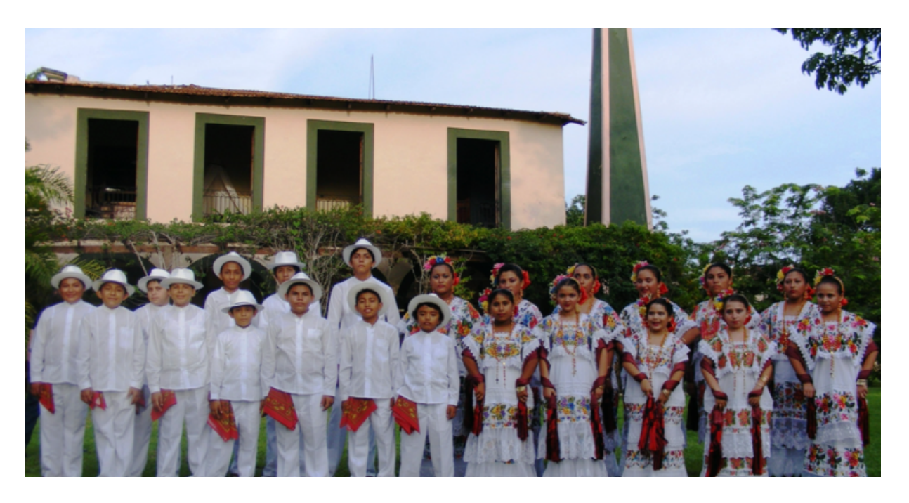
<u>Yidzat il kay Choir -</u> <u>Yucatán, Mexico</u>